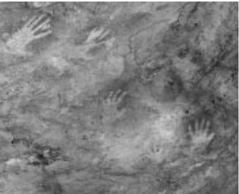
Mutawintji National Park